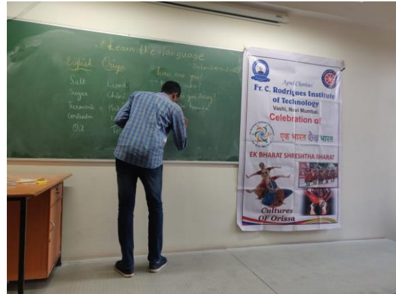
A Volunteer helping with writing the Oriya words on the board