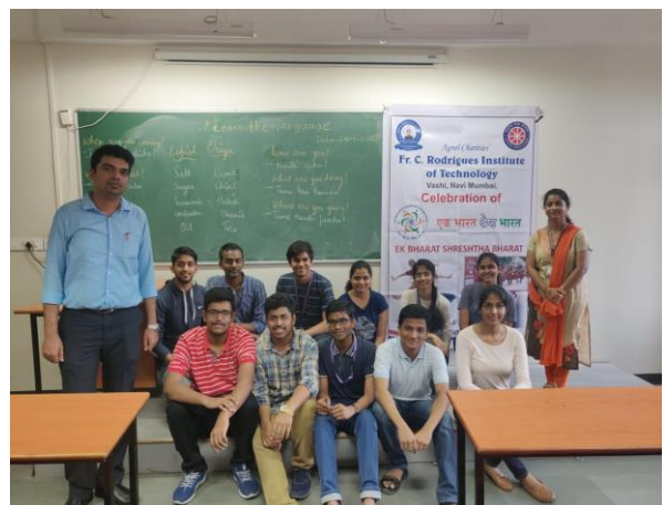
Few NSS Volunteers with staff coordinators