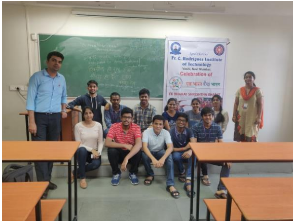
Few NSS students of Slogan writing with staff coordinators